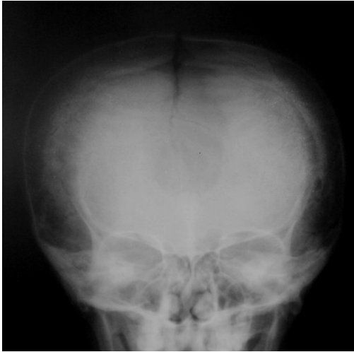
Fig. 3. PA view of the skull revealed widely open fontanelles and sutures

The extraoral findings were concurrent with the classical findings in a patient of CCD including: high prominent forehead, depressed nasal bridge, frontal bossing, hypoplasia of the maxilla along with false prognathism of the mandible resulting in a Dish Face appearance.