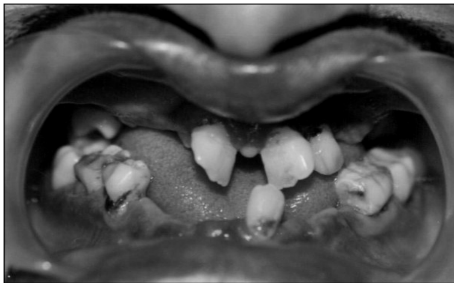
Fig. 2. Intraoral photograph showing periodontal status of patient

teeth. Over-retained deciduous molars and incisors were present. Pus was easily expressed from around these teeth. Bleeding on probing was present. The color of the gingiva was reddish pink with evident pigmentation. Periodontal pockets were seen in relation to 16, 17, 25, 26, 36, 37, 46 and 47 (Fig. 1). Grade 1 mobility was present in relation to 16, 17, 25, 26, 75 and grade 2 in relation to 84 and 85. Furcation involvement was noticed in 26, 75, 36, 84, 85 and 46. 11 and 21 were mesially rotated (Fig. 2). The patient's Loe H. Gingival Index Score was 2 (Moderate inflammation, edema, redness and bleeding on probing) and Russell AL Periodontal Index Score was 6.