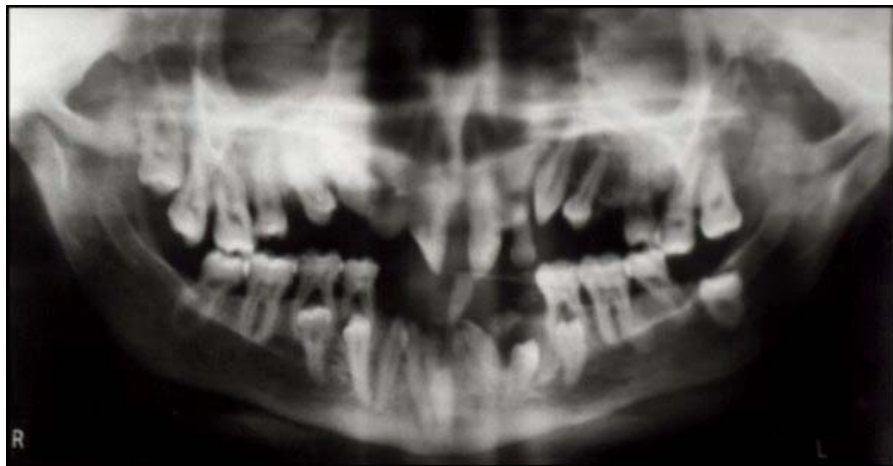
Fig. 5. OPG showing multiple retained deciduous and impacted teeth

Treatment Plan: Full mouth scaling and root planing has been done. The patient has been referred to the department of oral surgery for extraction of 18, 75, 38, 84 and 85. Following this we plan to remove the overlying bone and expose the unerupted teeth i.e. 14, 13, 23, 24, 35, 34, 33, 32, 31, 41, 42, 43, 44 and 45 which would then be orthodontically extruded. 11 and 21 would